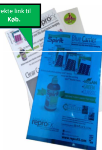
A16044 (Blue) A16045 (Clear)

Our ReproFX Carriers have been developed to improve the quality of "burns" on thermal style transfer machines by evenly spreading thermal energy over the entire ReproFX Spirit Thermal Transfer Paper. Many old machines like the 3M